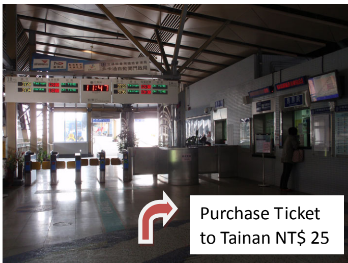
3. Purchase Ticket to Tainan