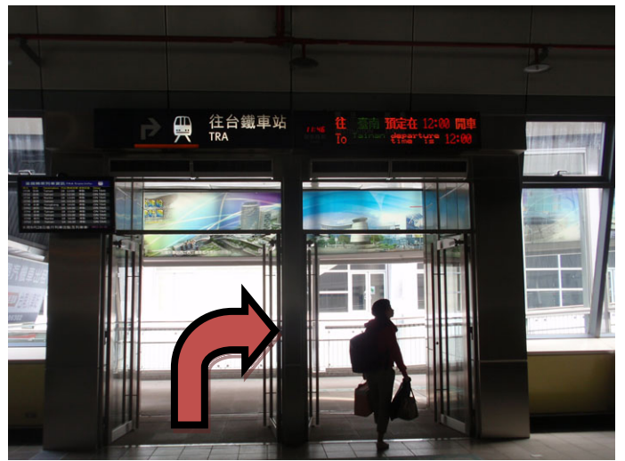
2. Take Right Turns