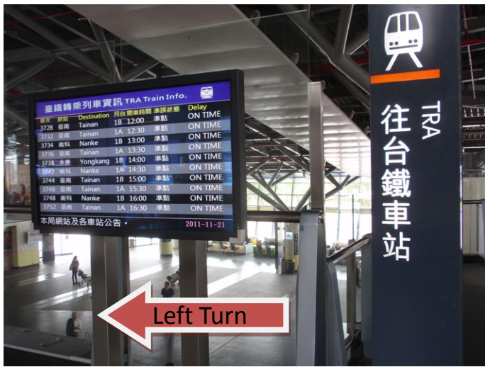
1. Take two Left Turns