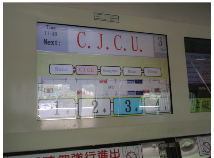
4. Transport information available on train