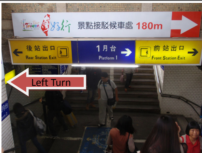
5. Left turn to Rear Station Exit at Tainan Station